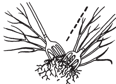
Perennials or Shrubs

Division. Most perennials left in the same place for more than 3 years are likely to be overgrown, overcrowded, have dead or unsightly centers, and need basic fertilizer and soil amendments. The center of the clump will grow poorly, if at all, and the flow-