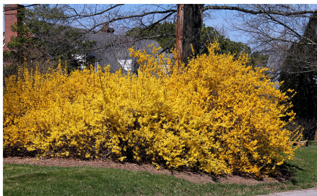
Figure 52. Border forsythia ( Forsythia × intermedia ) in flower (midspring).

Despite being quite common in landscapes and chosen for its only showy feature — yellow flowers that last for about two weeks a year — border forsythia is a rock star when in bloom (figs. 6, 52). This species is covered in bright yellow flowers (fig. 53) for about two weeks in midspring (produced on old wood) before leaves emerge. This fast-growing species tolerates poor growing conditions. To maximize the flower