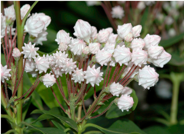
Figure 32. The difficulty of growing mountain-laurel ( Kalmia latifolia ) is offset by its beautiful flowers.

overall effect; its exquisitely beautiful flowers deserve close inspection (figs. 5, 31). The duration and beauty of the flower show in late spring is extended because the flower buds (prior to opening) are also colorful and elegantly beautiful (fig. 32). This species flowers on old wood.