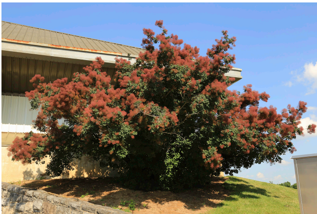
Figure 40. Smokebush ( Cotinus coggygia ) in flower.