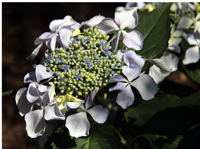
Figure 17. Lacecap flower of ‘Beauté de Vendômoise’ bigleaf hydrangea ( Hydrangea macrophylla ‘Beauté de Vendômoise’).