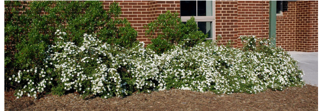
Figure 24. A white-flowered cultivar of bush cinquefoil ( Potentilla fruticosa ).