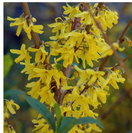
Figure 53. Close-up of border forsythia ( Forsythia × intermedia ) flowers.

show, site forsythia in full and rejuvenate old plants by cutting down all of the stems to near ground level or remove the oldest/largest stems. There are several cultivars that vary in the shade of yellow for flowers, plant size, and compactness. The parents of this hybrid are native to China.