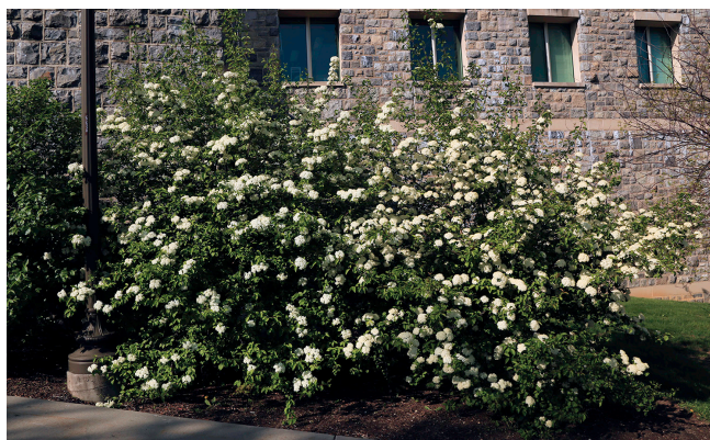
Figure 54. Blackhaw viburnum ( Viburnum prunifolium ) in flower (late spring).

Blackhaw viburnum is another native of the eastern U.S. that has a relatively showy flower display in midspring (figs. 54, 55). However, when compared to some of the common landscape viburnums, such as bigleaf hydrangea (fig. 16), this species may only be deemed moderately showy. Blackhaw viburnum makes up for this apparent inferiority by its fruit and fall foliage show as well as its tolerance for poor soils and drought. In late summer, about 1/3-inch egg-shaped fruits briefly turn a charming pink color before turning blue-black (fig. 56). While marginally showy dressed in the dark color, they are edible by humans