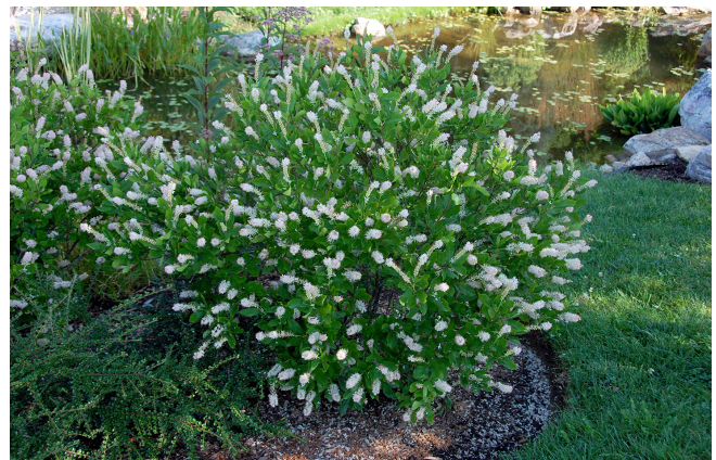
Figure 25. Summersweet clethra ( Clethra alnifolia ) in full midsummer bloom.

Summersweet clethra is cloaked in very sweetly fragrant white flower spikes in midsummer (figs. 25, 26). Flowers are so pleasantly scented that this species could be considered Mother Nature’s perfume. Flowers are borne on 5-inch long bottlebrushlike flower stalks and persist for about a month. Plants flower on new wood. This species suckers readily (produces