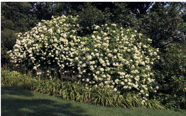
Figure 46. ‘Grandiflora’ panicle hydrangea ( Hydrangea paniculata ‘Grandiflora’) in flower (late summer).