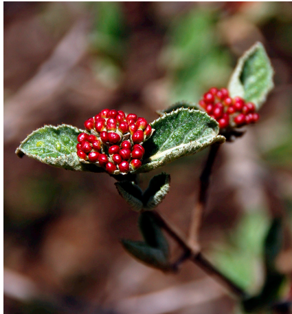
Figure 35. Showy flower buds of 'Compactum' Korean spice viburnum ( Viburnum carlesii 'Compactum').

als) turn pinkish in the late summer/early fall and add another color dimension to the flower show (fig. 38). While flowers are showy and numerous, collectively they do not completely blanket the exterior of the plant as in other heavily flowered species. Third, this species has lustrous evergreen foliage in zones 7 and higher; in zone 6 it will be semi-evergreen to deciduous, depending on the minimum winter temperatures. Fourth, numerous cultivars are available that vary in form (compactness), flower (abundance of flowers, fragrance), and foliage (yellow/gold or bronze and other variegations). 'Rose Creek,' for example, is a dwarf compact form with abundant flowers (fig. 39). A caution about some of these cultivars is that they will occasionally produce shoots that revert to the species characteristic (e.g., noncompact, nonvariegated); remove these branches to maintain the selected characteristics of the cultivar. Lastly, this is a tough shrub that tolerates drought, full sun to part shade, and regular shearing. Its evergreen foliage and pruning tolerance support its use as a hedge.