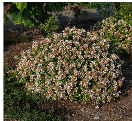
Figure 39. Compact form of 'Rose Creek' glossy abelia ( Abelia xgrandiflora 'Rose Creek').