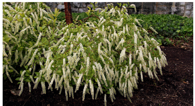
Figure 20. Virginia sweetspire ( Itea virginica ) in flower in late spring.

Virginia sweetspire has showy masses of pendulous 5-inch-long white flower spikes in early summer (figs. 20, 21). The slightly fragrant flowers are produced on last year's growth (old wood). This species has attractive, lustrous foliage that turns a beautiful, long-lasting maroon color in the fall (fig. 22). Virginia sweetspire suckers (produces shoots from root system) and over