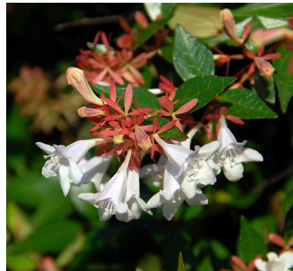
Figure 38. Close-up of glossy abelia ( Abelia xgrandiflora ) flower showing pinkish sepals beneath white petals.