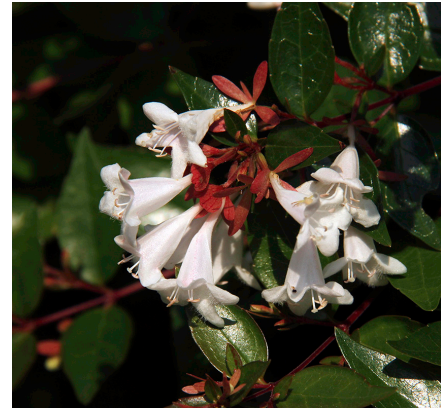
Figure 37. Close-up of glossy abelia ( Abelia xgrandiflora ) flowers.