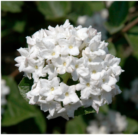
Figure 34. Flower cluster of 'Compactum' Korean spice viburnum ( Viburnum carlesii 'Compactum').