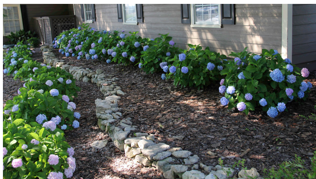
Figure 16. Spectacular flower midsummer show of Endless Summer (‘Bailmer’) bigleaf hydrangea in mass ( Hydrangea macrophylla Endless Summer).

Although native to Japan, bigleaf hydrangea is one of the most popular flowering shrubs in the U.S. The reason is obvious: a bigleaf hydrangea laden with large colorful flowers for weeks or months during the summer is a spectacular sight (fig. 16). Similar to the smooth hydrangea, bigleaf hydrangea has two types of very showy flowers: flat-topped flowers (lacecap type; ring of showy sterile florets surrounding an inner circle of less showy fertile flowers; fig. 17) and globe-shaped (mophead or hortensia type; sphere of mostly sterile florets; fig. 18). The choice of these flower types depends on personal preference. Flower type affects