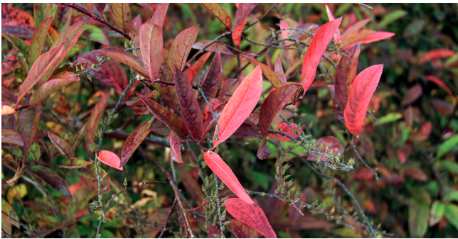
Figure 22. Showy red fall foliage of Virginia sweetspire ( Itea virginica ).

time the mother plant will produce a colony of stems. This species is a wetland species native to the eastern U.S., but it will do fine with average moisture conditions and is shade-tolerant.