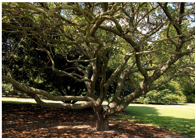
Figure 8. Small tree form of white fringetree ( Chionanthus virginicus ).

growth rate are influenced by its species characteristics and environmental conditions.