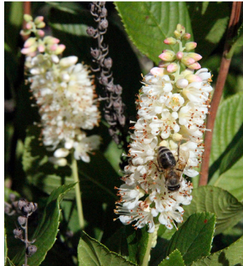
Figure 26. Close-up view of summersweet clethra ( Clethra alnifolia ) flowers.