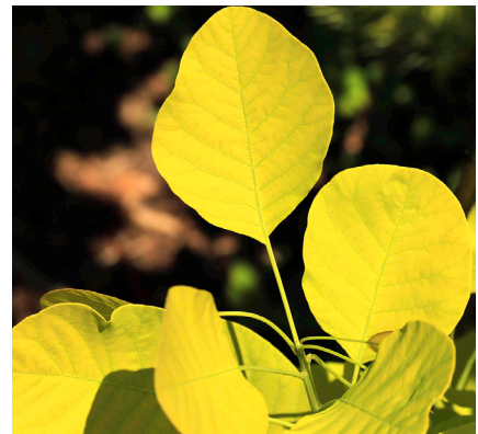
Figure 43. Yellow foliage of Golden Spirit (‘Ancot’) smokebush ( Cotinus coggygia Golden Spirit).