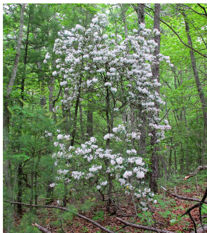
Figure 5. Mountain-laurel ( Kalmia latifolia ) in bloom in its native habitat.