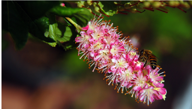
Figure 27. Pink flowers of 'Ruby Spice' summersweet clethra ( Clethra alnifolia 'Ruby Spice').

shoots from the roots), so over time it forms a colony of plants originating from the mother. It tolerates shade and is a wetland species, yet it grows well in most acid soils except for soils that tend to be dry. The species has a natural, informal appearance that may not be suitable for some landscapes. The cultivars 'Compacta' and 'Hummingbird' have a smaller, compact form and lend themselves to a formal landscape. In addition to plant size/habit, other cultivars have been selected for foliage characteristics, flower size and color (fig. 27), and time of flowering. Native to the eastern U.S.