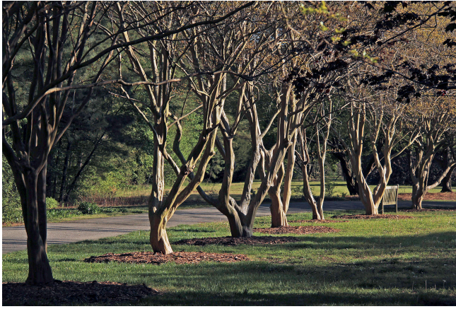
Figure 50. Crapemyrtle's beautiful form ( Lagerstroemia spp.) when pruned