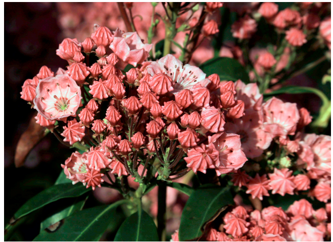
Figure 33. Flower cluster of 'Sarah' mountain-laurel ( Kalmia latifolia 'Sarah').

So, why is mountain-laurel not in everyone's garden? The reason is that the degree of its beauty is matched by the degree of difficulty in having this species thrive in man-made landscapes. There are two main cultural aspects to successfully growing this species: (1) very well-drained, loose acid soil is a must; soils with high amounts of organic matter are ideal and (2) plants also require a part shade exposure in the afternoon, especially in winter. An exception to the part shade requirement is that the author has observed plants doing quite well in full sun in mountain environments where temperature, rainfall, and soils are radically different from environmental conditions typical of most residential settings.