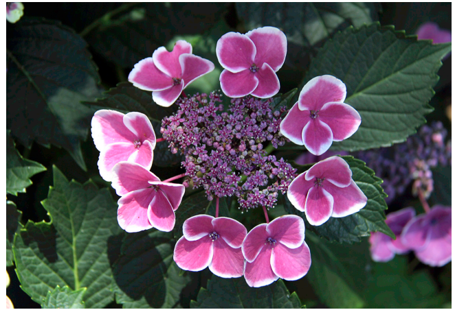
Figure 19. Lacecap flower of 'Frau Reiko' bigleaf hydrangea ( Hydrangea macrophylla 'Frau Reiko').

There are hundreds of bigleaf hydrangea cultivars that vary in flower and leaf characteristics, stem strength, hardiness, and mildew resistance. In "Hydrangeas for American Gardens," Michael A. Dirr, the world's premier woody plant expert, has a scholarly and comprehensive treatment of bigleaf hydrangea. In this pub-