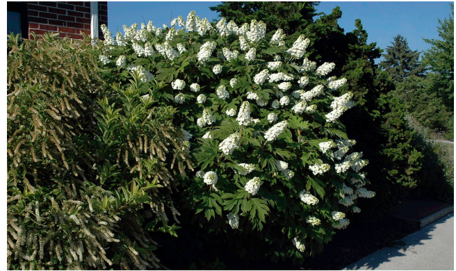
Figure 28. Oakleaf hydrangea ( Hydrangea quercifolia ) in flower (early summer).

Oakleaf hydrangea has upright branches, large oaklike leaves (with prominent lobes), and large cone-shaped white flower clusters in early summer (figs. 28, 29). The overall flower effect is quite showy. Plants flower on old wood. There are several cultivars that vary in size (from small to large), compactness, flower (single, double, or maturing to burgundy-pink), and leaf characteristics. Fall foliage color is a red-maroon and can be quite attractive (fig. 30). Stems have bark