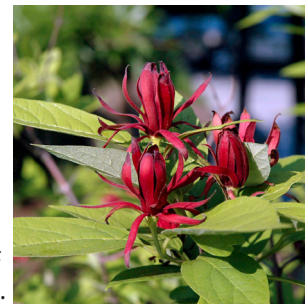
Figure 3. Close view of common sweetshrub ( Calycanthus floridus ) flowers.