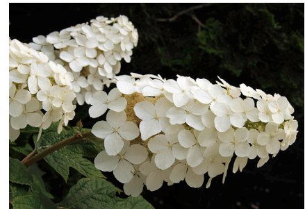
Figure 29. Flower cluster of oakleaf hydrangea ( Hydrangea quercifolia ).