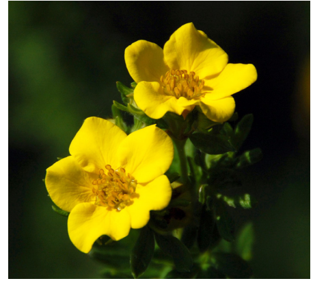
Figure 23. Close-up of bush cinquefoil ( Potentilla fruticosa ) flowers.

Native to the northern hemisphere, bush cinquefoil produces 1-inch yellow flowers from June until frost on new wood (fig. 23). There are numerous cultivars with orange-yellow, white, and pink flowers; double-flowered forms are also available. This slow-growing species grows in a mounded form (fig. 24). The flowers are its principal aesthetic characteristic. It will tolerate shade but the best floral display occurs in a full sun exposure. Bush cinquefoil is quite tolerant of dry soils and low temperatures.