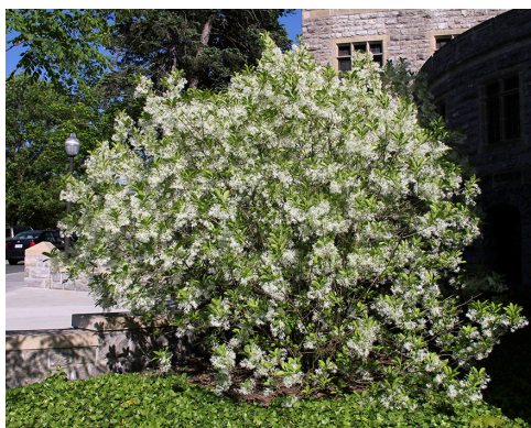
Figure 7. Shrub form of white fringetree ( Chionanthus virginicus ).

Plant width can vary from narrow to wide and will affect its function in the landscape. A shrub's size and