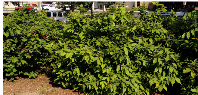
Figure 2. Common sweetshrub ( Calycanthus floridus ) in bloom, but the flowers can only be appreciated upon close inspection.