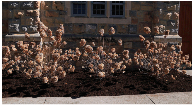
Figure 47. Persistent brown flower clusters on panicle Hydrangea ( Hydrangea paniculata ; unknown cultivar).

after flowering and not in late summer or the dormant season). Because most of the cultivars flower on new wood, they produce flowers in the summer, a period when there are relatively few woody plants in flower. A full sun exposure produces the best flower show. Native to Asia.