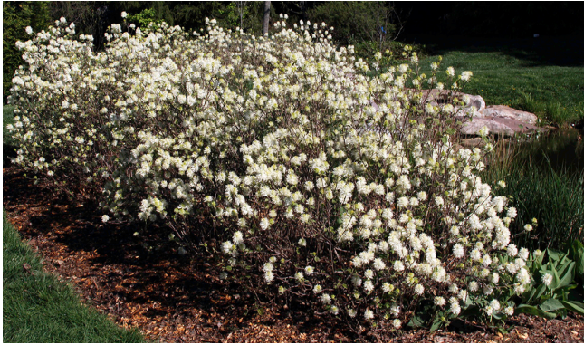
Figure 9. Showy flower display of Mount Airy fothergilla ( Fothergilla 'Mount Airy').