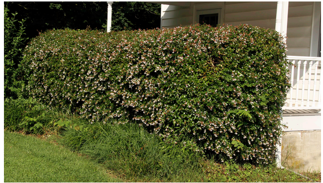
Figure 36. Glossy abelia ( Abelia xgrandiflora ) in flower (as a sheared hedge).

als) turn pinkish in the late summer/early fall and add another color dimension to the flower show (fig. 38). While flowers are showy and numerous, collectively they do not completely blanket the exterior of the plant as in other heavily flowered species. Third, this species has lustrous evergreen foliage in zones 7 and higher; in zone 6 it will be semi-evergreen to deciduous, depending on the minimum winter temperatures. Fourth, numerous cultivars are available that vary in form (compactness), flower (abundance of flowers, fragrance), and foliage (yellow/gold or bronze and other variegations). 'Rose Creek,' for example, is a dwarf compact form with abundant flowers (fig. 39). A caution about some of these cultivars is that they will occasionally produce shoots that revert to the species characteristic (e.g., noncompact, nonvariegated); remove these branches to maintain the selected characteristics of the cultivar. Lastly, this is a tough shrub that tolerates drought, full sun to part shade, and regular shearing. Its evergreen foliage and pruning tolerance support its use as a hedge.