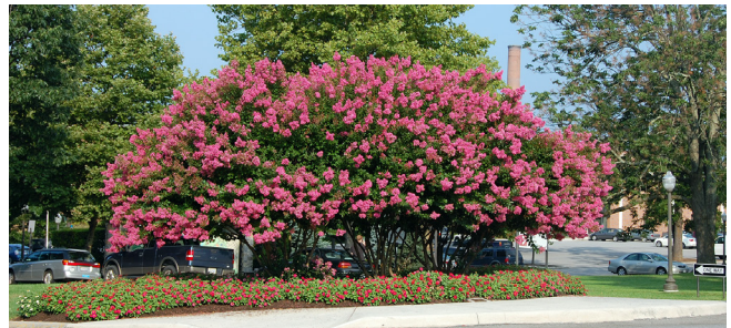
Figure 48. Crapemyrtle ( Lagerstroemia spp.; unknown cultivar) in flower.

The flower display of crapemyrtles is one of the showiest of all flowering shrubs (fig. 48). The reason for this is that (1) flower colors include shades of red, pink, lavender, rose, fuchsia, purple, and white (fig. 49); and (2) flower clusters (up to 8 inches long) can