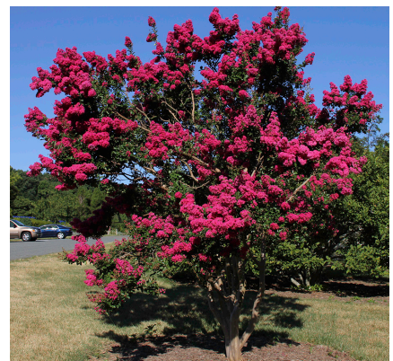
Figure 49. ‘Tonto’ crapemyrtle ( Lagerstroemia ‘Tonto’) in midsummer flower.