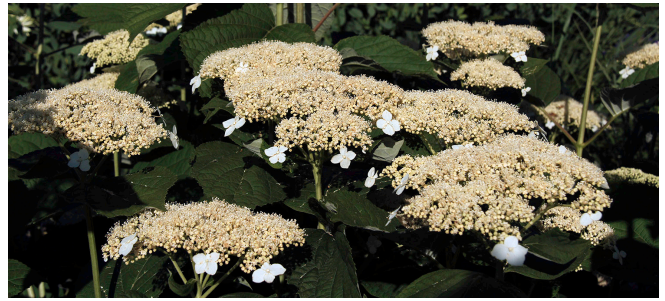
Figure 12. Lacecap flowers of 'White Dome' smooth hydrangea ( Hydrangea arborescens 'White Dome').

Smooth hydrangea produces showy, 4-inch, white flat-topped flowers (lacecap type; ring of showy sterile florets surrounding the inner circle of less showy fertile flowers) in late spring/early summer that persist for about a month; some cultivars bloom into July (figs. 12, 13). There are a few clones that have large (up to 10+ inches wide) globe-shaped (mophead type; sphere of mostly sterile florets) flowers with 'Annabelle' (fig. 14) and Incrediball ('Abetwo') being some of the more popular forms in the trade. Clones with spherical flowers are quite showy due to the abundance of large-size