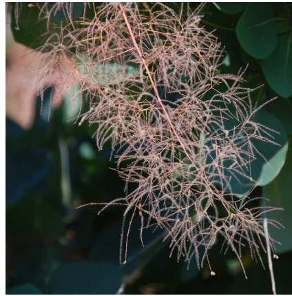
Figure 41. Close-up of plume (filaments) of smokebush ( Cotinus coggygia ).