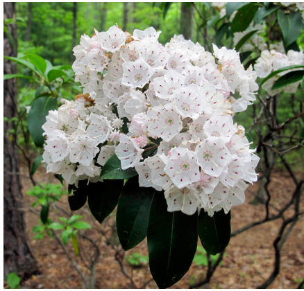
Figure 31. Flower cluster of mountain-laurel ( Kalmia latifolia ).