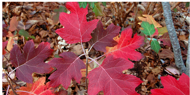
Figure 30. Showy fall foliage color of oakleaf hydrangea ( Hydrangea quercifolia ).

that peels or exfoliates, which is an attractive feature in winter. Oakleaf hydrangea tolerates shade; however, shade-grown plants tend to have very large leaves and reduced flower production. The large, oaklike leaves impart a coarse/bold texture to the plant. Native to the southeastern U.S.