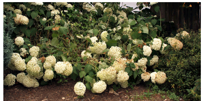
Figure 15. Floppy stems of 'Annabelle' smooth hydrangea ( Hydrangea arborescens 'Annabelle') under the weight of its flowers.