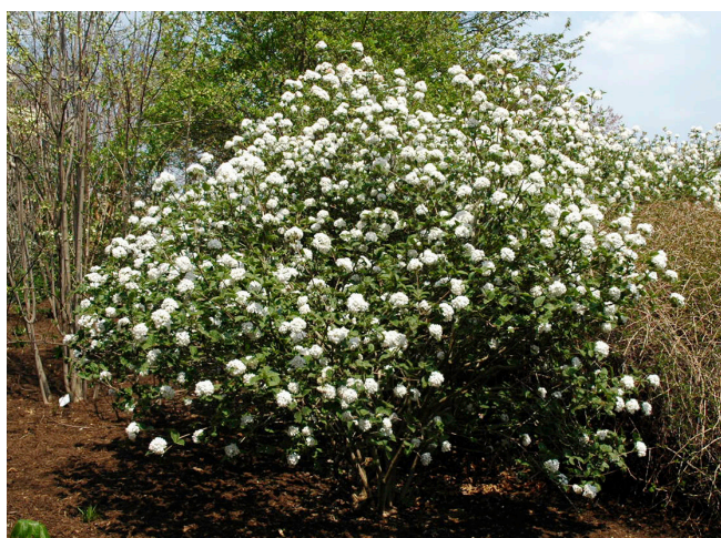
Figure 4. ‘Compactum’ Koreanspice viburnum ( Viburnum carlesii ‘Compactum’) in flower.

To enhance the multiseasonal appeal of your landscape, select species that flower throughout the spring and summer. Also choose species that have attractive plant features such as fruit, leaves, stem color and bark