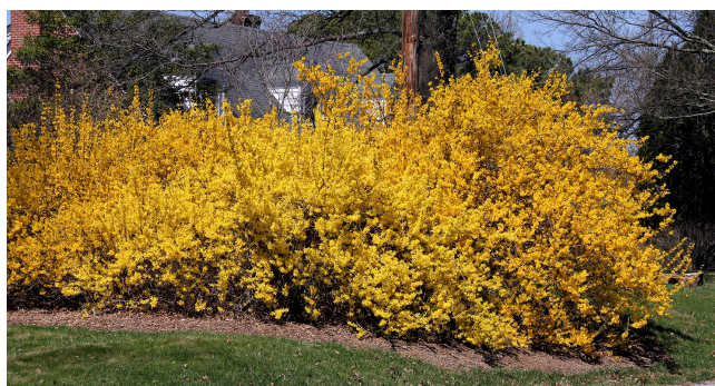
Figure 6. Border forsythia ( Forsythia ×intermedia ) in flower (midspring).

features, texture, or shape that can provide showiness during nonflowering times.