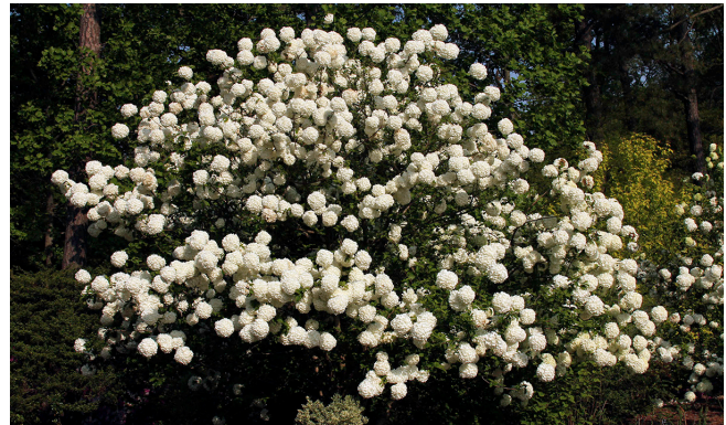
Figure 1. Chinese snowball viburnum ( Viburnum macrocephalum ) with an impressive display of flowers (mid-to late spring).

fig. 1) are covered in large flowers, creating a major impact when viewed at a distance. Other shrubs such as common sweetshrub ( Calycanthus floridus ; fig. 2) have fewer flowers and require a close proximity for flowers to be appreciated (fig. 3). Individual flowers may be just as attractive, or even more appealing, as