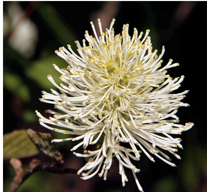
Figure 10. Mount Airy fothergilla ( Fothergilla 'Mount Airy') flower offers beauty in mid spring.