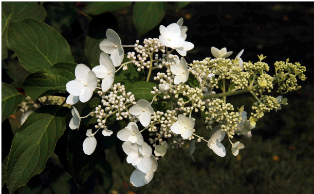
Figure 45. Flower cluster of ‘Unique’ panicle hydrangea ( Hydrangea paniculata ‘Unique’).

In the garden center trade there are numerous cultivars (30 +) of panicle hydrangea that vary in size, form, and flower characteristics. Flower characteristics include time of flowering (June to September) and flower cluster size (fig. 45). ‘Grandiflora’ is the patriarch of the cultivars, introduced in the 1860s, and is a large shrub/small tree form that is spectacular in flower (fig. 46). This cultivar has been described as overused and coarse, but beauty is in the eye of the beholder. ‘Phantom’ has especially large flower clusters. White flower clusters eventually turn brown and tend to persist on the plant, a feature that is often noted as a liability (fig. 47). This aspect can be interpreted as an attractive feature. On the plus side, panicle hydrangea is relatively easy to grow and is the toughest hydrangea for challenging site conditions. This species flowers on new wood except for the cultivar ‘Praecox,’ the earliest flowering cultivar (early summer); it flowers on old wood (so prune right