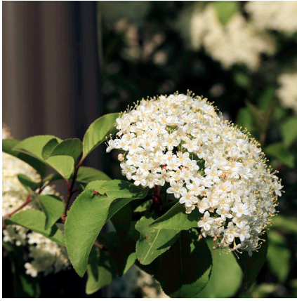
Figure 55. Close-up of blackhaw viburnum ( Viburnum prunifolium ) flower cluster.