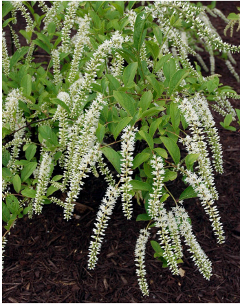
Figure 21. Close-up of Virginia sweetspire ( Itea virginica ) flowers.