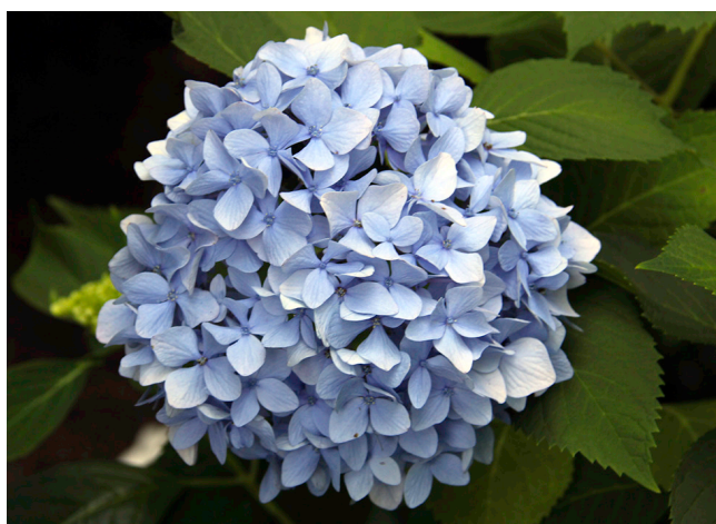
Figure 18. Ball-shaped flower of ‘Dooley’ bigleaf hydrangea ( Hydrangea macrophylla ‘Dooley’).

the overall plant texture; lacecap flowers confer a fine texture, whereas mophead types convey a bold texture.