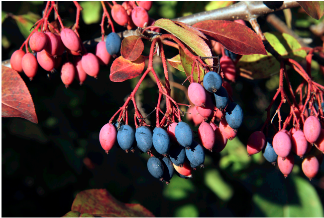
Figure 56. The attractive fruit cluster of blackhaw viburnum ( Viburnum prunifolium ) offers fall interest and food for wildlife.

and a favorite of local wildlife. The fall foliage varies from plant to plant and from fair to good with shades of red, maroon, or orange. This stiffly upright growing species is commonly found along roadsides, hillsides, and fencerows throughout the eastern U.S. Despite this ubiquity, it is rarely found in garden centers. You can special order this species through your local nursery professional or from mail order nurseries. The common name, blackhaw, is derived from the color of the fruit and its stiffly branched form that is likened to that of a hawthorn (but is not at all related to a hawthorn).