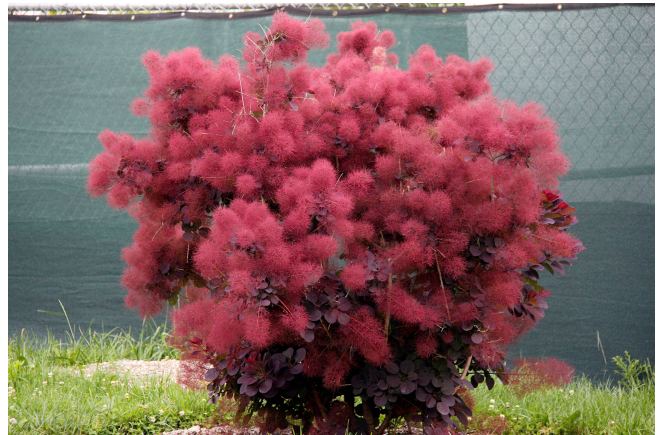
Figure 42. ‘Royal Purple’ smokebush ( Cotinus coggygia ‘Royal Purple’) produces a cloudlike display of flowers.