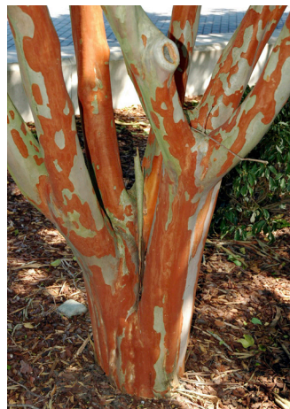
Figure 51. Stunning, exfoliating bark of 'Natchez' crapemyrtle ( Lagerstroemia 'Natchez').

be produced for most of the summer (depending on cultivar). Adding to its appeal are a beautiful form (fig. 50), very handsome bark (some smooth and some exfoliating; shades of white, tan, and cinnamon-brown bark; fig. 51), its tolerance of poor soils and legendary heat and drought tolerance, and showy fall foliage color. Crapemyrtle, minus a few shortcomings, is a superstar in the landscape!