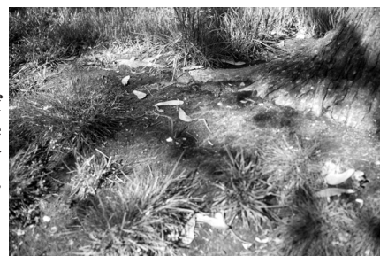
The presence of moss may indicate a wet or poorly drained soil.

Wet sites are sites where water either stands for long periods of time, or where drainage is slow (on average less than 1"/hour). Wet sites also can be sites that receive considerable runoff from higher elevations. In wet soils, too much water in the soil fills the air spaces, resulting in low oxygen levels. Where oxygen is lacking, water and nutrient uptake stops, plant processes and growth cease, and trees begin to decline or die.