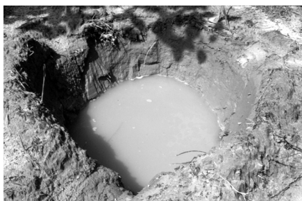
Determine soil drainage with the "hole test."

To roughly gauge the rate of drainage for a particular soil, try the "hole test." Dig a hole approximately one foot deep and fill it with water. Time the rate (on