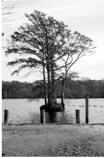
Bald cypress is a species very tolerant of wet sites.

Many trees have adapted to growing in wet sites. For example, when growing in or around water, bald cypress produces protruding knobs (“knees”) that extend above water or the saturated soil. These knobs are thought to help with air absorption into the roots. Willows and ashes, when stimulated by flooding, produce new air-filled roots to replace roots killed by excess moisture.