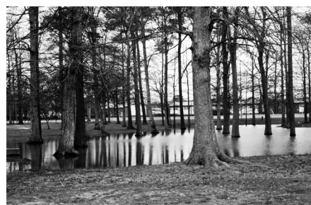
Standing water may be an indication of either a wet site or slow drainage.